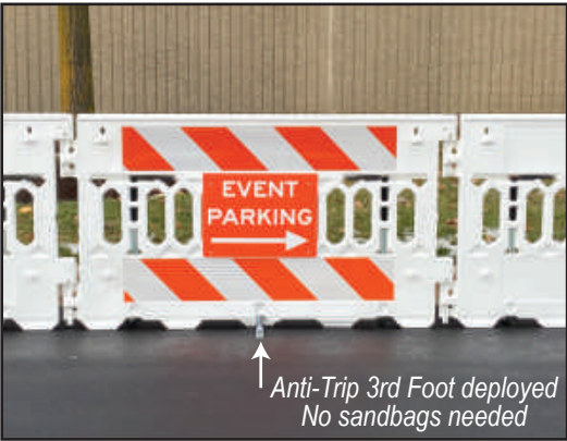
Add Signs for Crowd Control