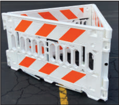
Use Three Units To Create Manhole Guard

Sign Area: Holds 20"W x 14"H Sign on each side (screw on)