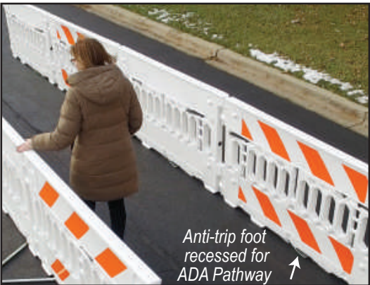
Create ADA Compliant Pedestrian Pathway